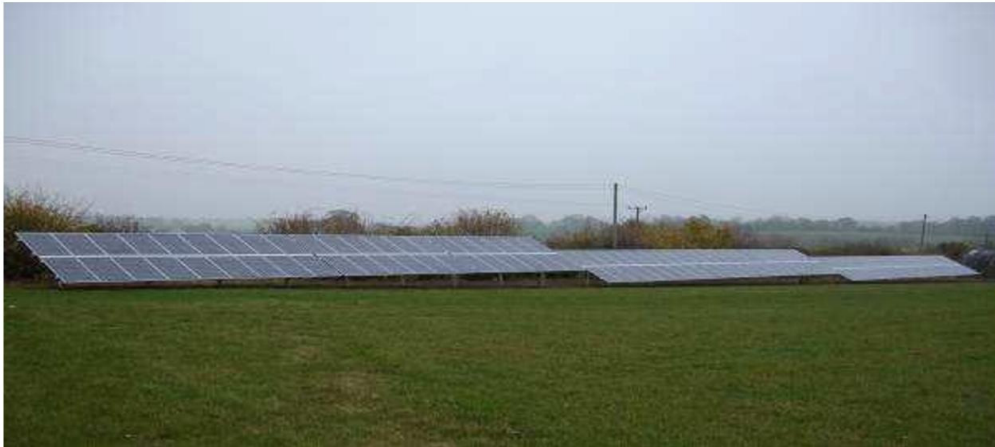
Photo of an installed 30kW ground mounted PV system.

Please see the submitted layout drawings that shows the dimensions of each ground mounted structure.