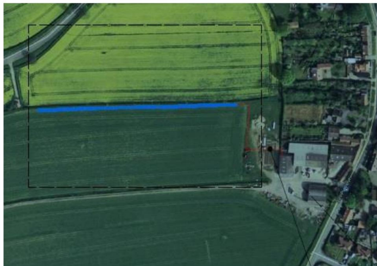
Aerial photo of Manor Farm. The blue areas are the proposed locations of the panels.