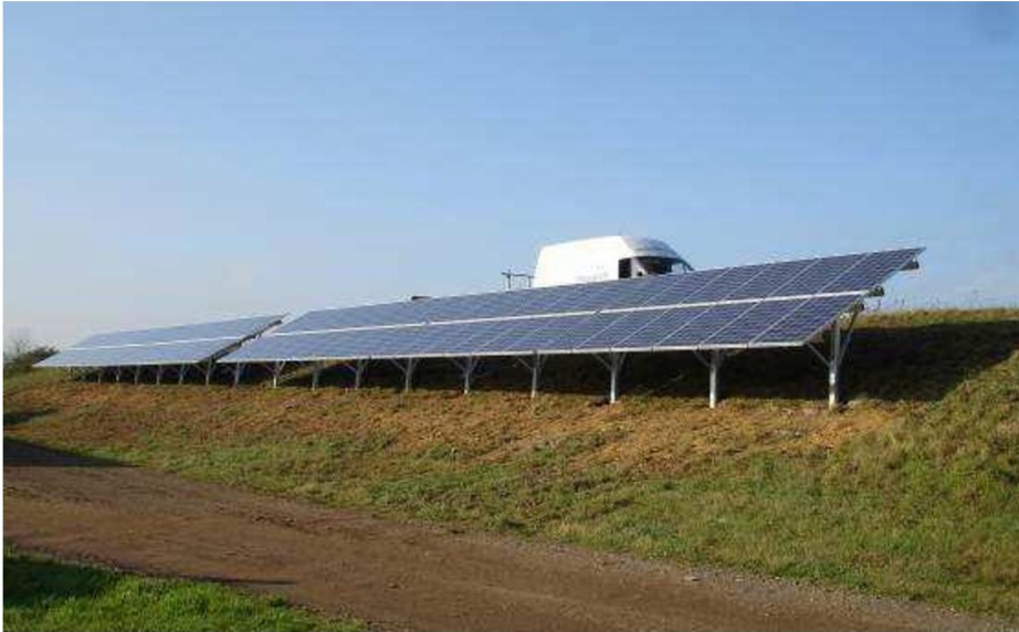
Photos of an installed 20kW ground mounted PV system.

The panels will be ground mounted on a free standing custom built structure. Below are some photographs of installation of previous ground mounted PV systems. Each individual structure will look similar to the photos below.